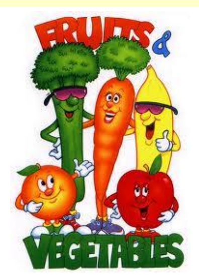
Children need healthy snacks to help them learn.

"Chronic tardiness in elementary and middle school is also linked to failure in high school. "